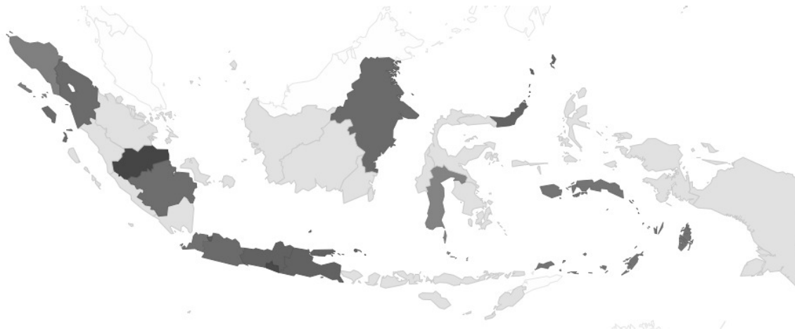
Figure 1. Astronomy Institutions and Community distribution in Indonesia. The dark grey area represent provinces which have astronomy institutions or community.