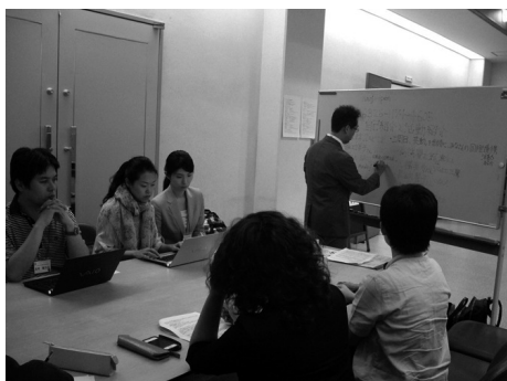
Figure 3. Group discussion at the Universal Design Astronomy conference.

projects of TF2 in 2013 led by Dr. Amelia Ortiz-Gil in Spain developed an astronomical kit for the visually impaired [5].