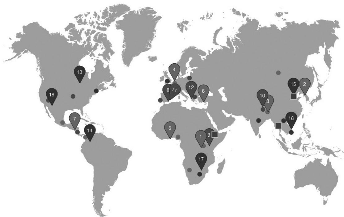
Figure 1. Funded projects in 2013 (balloon) and 2014 (circle). The 2013 and 2014 projects were selected in 2012 and 2013, respectively. Regional centers (square) are also shown. The original figure is presented on the OAD brochure.